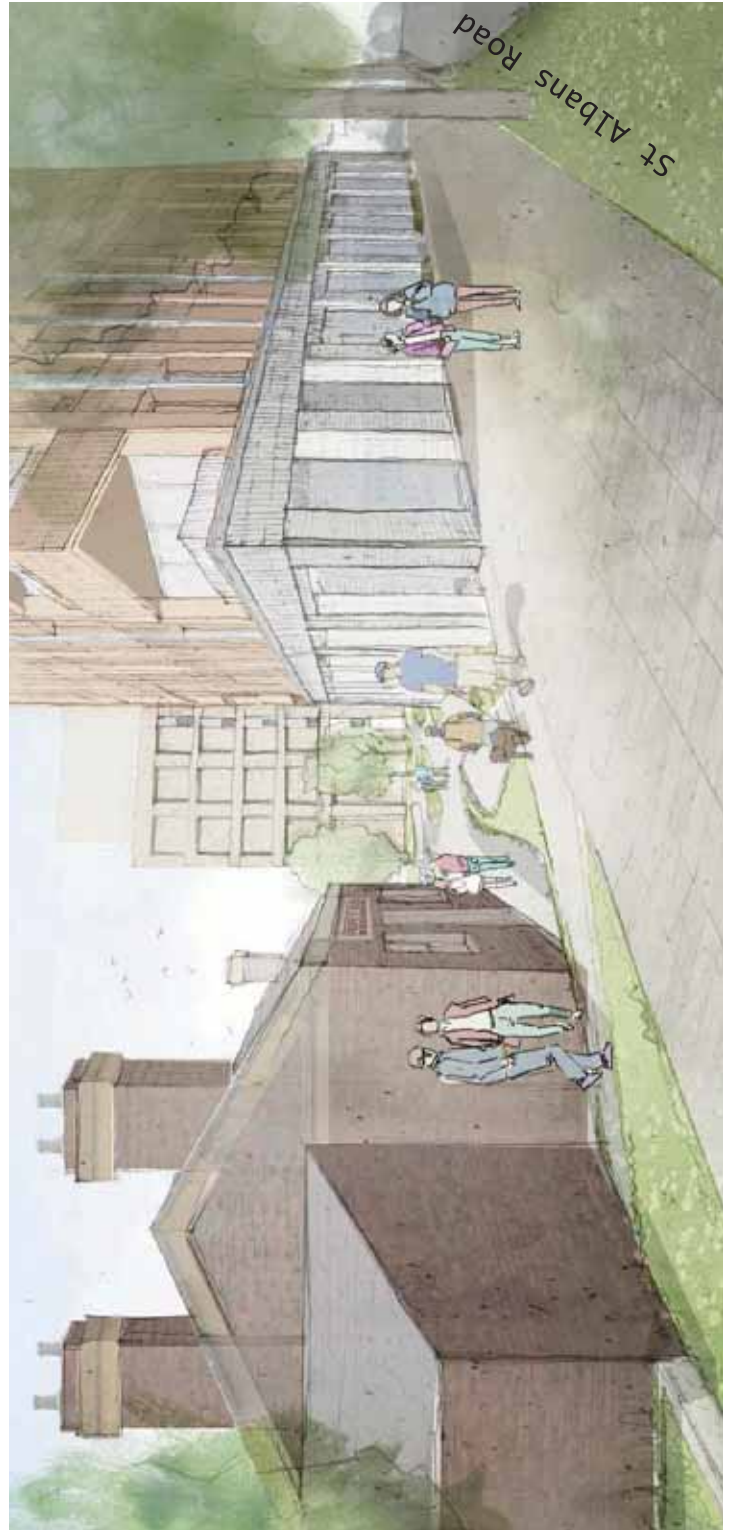
Entrance from St Albans Road